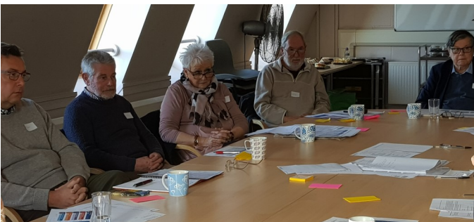
Chairs discussing ideas on why some PPGs work and some don't at their first meeting.

Patient feedback on their experiences of using services is also captured in an annual 'National GP Patient Survey'. 2019 results for Sutton and individual practices can be found online: gp-patient.co.uk . Our current work with PPGs is focusing on empowering and supporting 6 PPGs at practices where the 2019 survey results indicated lower or declining levels of patient experience. PPGs, working with their practice are looking to better understand the reasons behind their patient feedback, so they can identify areas where changes or improvements could be made.